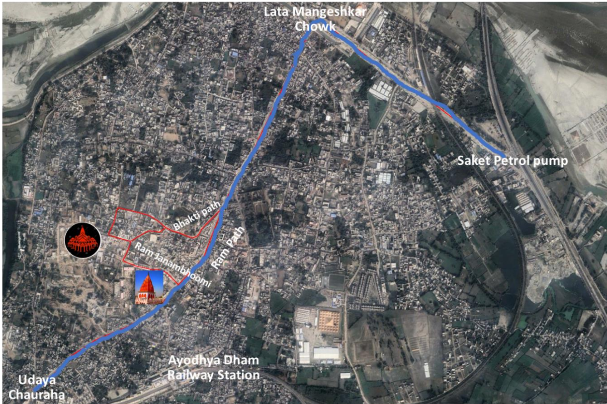
Figure 1 The route map

In 2021, Ayodhya Development Authority came out with a vision to develop the City as a “Global Spiritual destination” by 2047. One of the major Goal to achieve this vision is promotion of “Diversified tourism” and many projects such as Surya Kund, Ghats, Ram Ki Paidi, old temples and Math mandirs have been developed or restored as a testament to ADA's commitment to preserving Ayodhya's heritage while enhancing its contemporary vibrancy. Since the consecration of the Shri Ram Janam Bhoomi, lakhs of visitors and devotees are visiting Ayodhya. The main road approaching the temple area is closed for regular traffic between Saket petrol pump to Tedhi Bazaar which is almost a 6km stretch hence it becomes difficult for devotees and visitors especially universally challenged to walk the long stretch in scorching heat to reach the temple area. Through E rickshaws ply in this stretch but it is difficult to regularise them, hence it is important to enhance the public mobility within the Ayodhya town area for an easy and organised commute of the devotees and visitors in the proximity area of Ram Janmabhoomi.